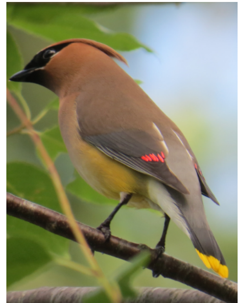
Way better in color! - check out www.pasadenaudubon.org

Although the cedar waxwing will not draw attention to itself with a beautiful song, you cannot help but admire its sleek appearance, note its voracious appetite and welcome its arrival in your backyard every year.