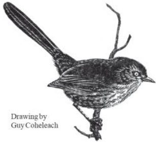
Drawing by Guy Coheleach