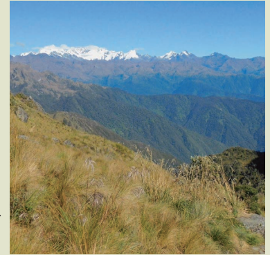
A view from the trail.

Readers, if there's a Bird from Afar that you saw and loved, we'd love to hear about it. Send your text and photos to the Editor at pas.wrentit@gmail.com .