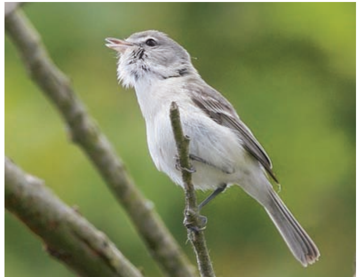
Least Bell's Vireo

Let the world know you're with Pasadena Audubon. Go to www.zazzle.com/pasadena_audubon for T-shirts, water bottles, luggage tags and more, all featuring our lovely wrentit logo.