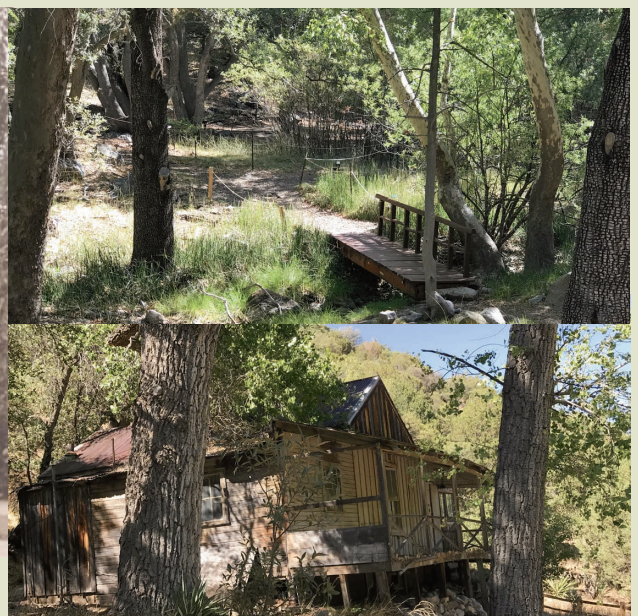
Present Day Ramsey Canyon and historical cabin.