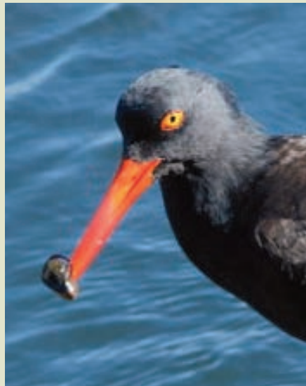
Black Oystercatcher

After the count, we join together to celebrate with a catered dinner and drinks. You'll also hear about what turned up and how it compares to past years. The dinner is $20 per person. Please RSVP by December 9th by sending a check to Pasadena Audubon Society, 1750 N. Altadena Drive, Pasadena, CA 91107, or make an online payment on our website. Be sure to mention CBC.