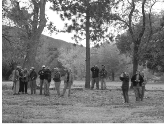
PAS members turn to higher authority for raptor ID.

We met at Lake Palmdale in the howling wind, trying to steady our shaking scopes to get a decent look at whatever was floating, diving, and swimming in the lake. And right from the start we found a Common Loon,