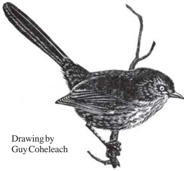
Drawing by Guy Coheleach