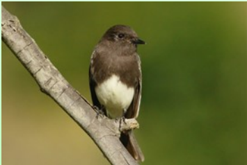
Black Phoebe – flies out from low perches catching insects, flicks his tail. Often calls "Fee-beee."