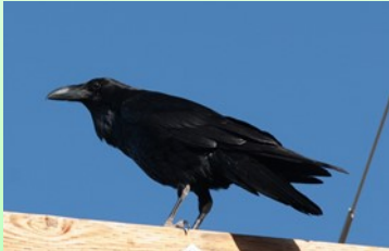
Common Raven – soars and perches, look for the pointy tail in flight, loud croaking call.