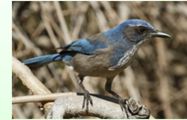
California Scrub Jay – beautiful long blue tail and wings, seen in trees and flying. Harsh call.