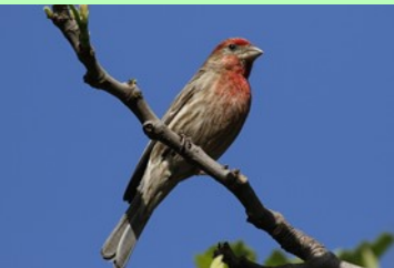
House Finch – look for the red face and breast, and listen for the quick clear melodious song.