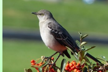
Northern Mockingbird – loudest summer singer, changing his tune at regular intervals. Has white patches on his wings.