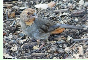
California Towhee – hops around on the ground, scratching the leaves and dirt for insects. Metallic chip call.