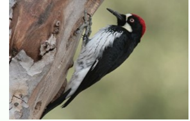
Acorn Woodpecker – seen on tree trunks, especially dead ones where they store acorns. Laughing call.