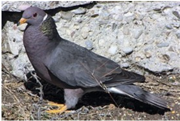
Band-tailed Pigeon – seen on wires and in treetops. Look for the white neck band and yellow bill and feet.