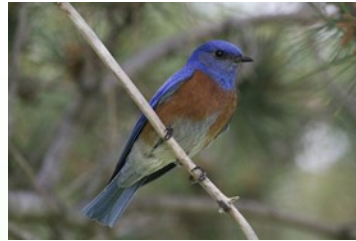
Western Bluebird – beautiful blue back and wings, flies from low branches to the ground and back.