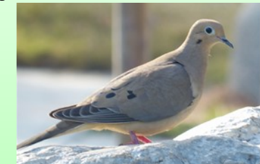
Mourning Dove – often on the ground, their sad cooing song is heard all day. Look for spots on the wings.