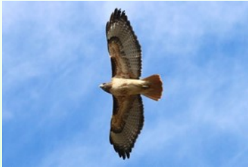
Red-tailed Hawk – seen soaring, look for the red triangular tail. Black leading edge on wings.