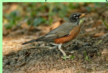
American Robin – seen in treetops and on the ground, fairly big with a chirpy cheery song.