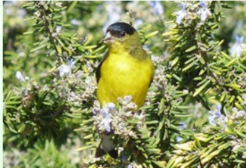
Lesser Goldfinch – little yellow and black birds, usually seen in pairs or groups. White on wings.