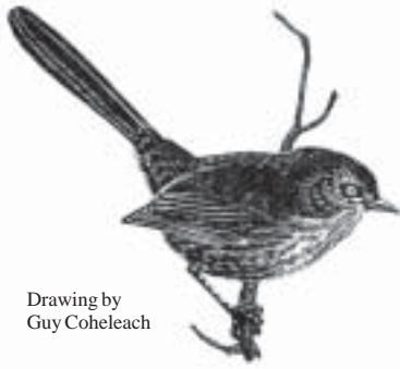
Drawing by Guy Coheleach