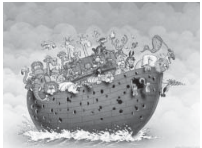
"The woodpecker may have to go."