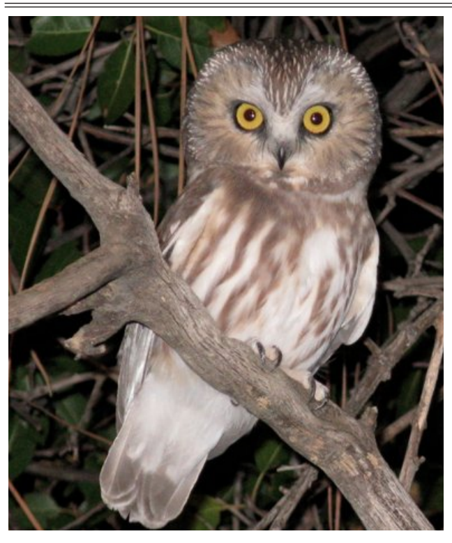
Looks even better in color! Check out www.pasadenaaudubon.org