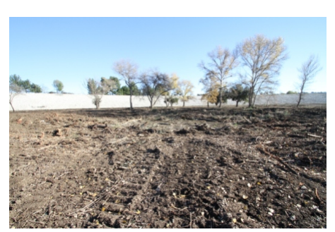
The same location today.