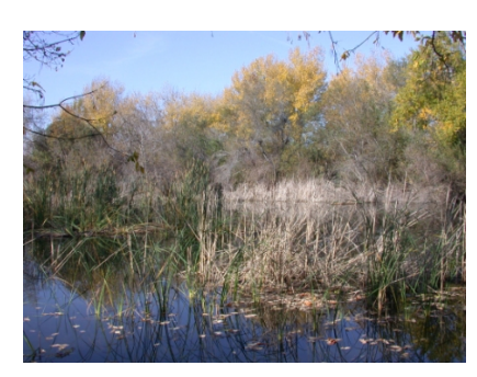
A "pothole pond" in the affected area, shown in 2010, sheltered migrating waterfowl.

San Fernando Valley Audubon continues to closely track this issue. Get updates by checking their web site at <a href="https://www.sfvaudubon.org">www.sfvaudubon.org</a>.