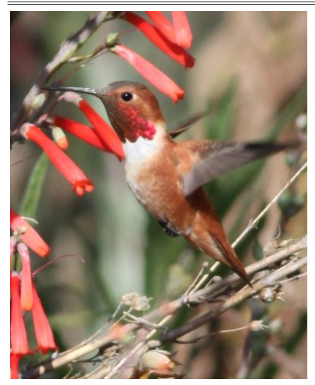
Looks even better in color! Check out www.pasadenaaudubon.org