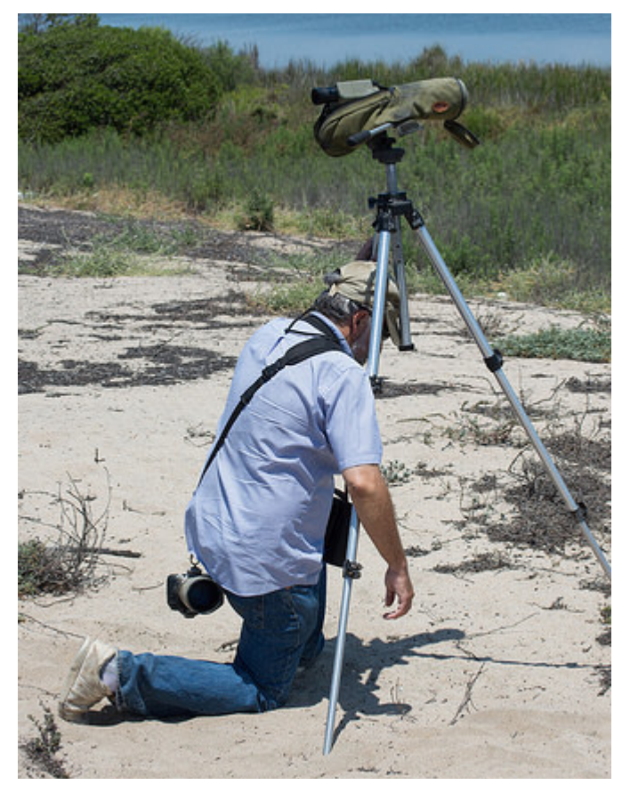
...Weight Can Be a Factor