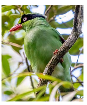
Bornean Green Magpie

The last half of the trip was our absolute favorite. We spent ten days in the lowland jungles of Sabah. While the jungle lived up to its reputation of hot and steamy, we saw four species of stunning Pittas including Black-headed, Bornean Banded, Hooded, and Blue-headed.