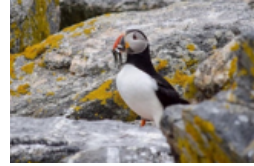
Atlantic Puffin