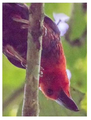
Bornean Bristlehead

One of the strangest birds we encountered was the rather bizarre looking Bornean Bristlehead. The monotypic Bristlehead is the only bird in its genus (Pityriasis) and in its entire family (Pityriasisdae). We also had good looks at the endemic Bornean Wren-Babbler and the Black-throated Wren-Babbler. While the birds were amazing, the Danum Valley will always be remembered by us as one of our