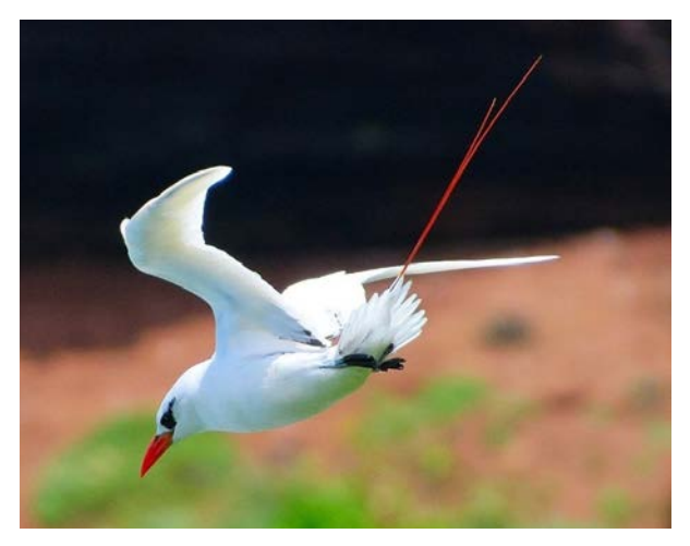
Red-tailed Tropicbirds are numerous at Kilauea Point National Wildlife Refuge.

The Kauai Endangered Seabird Recovery Project is an agency that protects and monitors Kauai's endangered seabirds. For examples, radio telemetry data has shown that Newell's Shearwaters have