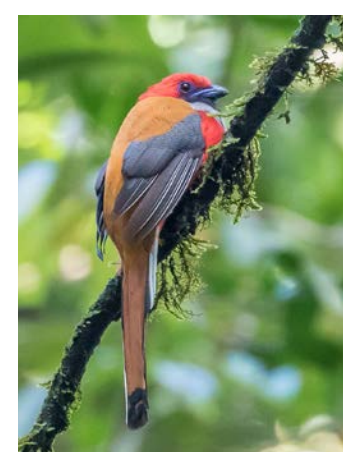
Whitehead's Trogon

for some time from our boat, while we enjoyed coffee no less! There was plethora of Hornbill species to be enjoyed, including the White-crowned Hornbill.