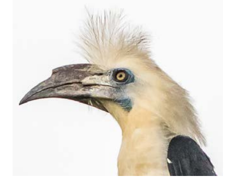
White-crowned Hornbill

the trip. On the Kinabatangan River, we had even greater