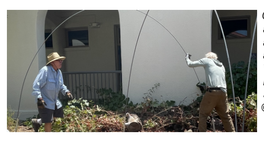
George Patton and Jerry Ewing assemble an arbor in the Washington Elementary STEM garden.

In addition to soil, water and sunlight, gardens need sweat equity! Many thanks to the volunteers who dedicated their time and energy to revamping our native habitat garden space at Washington Elementary STEM Magnet School! To prepare for the new school year, PAS' George Patton and Jerry Ewing helped build an arbor for Roger's Red grapes growing in the garden. PAS also teamed up with Outward Bound Adventures (OBA), inviting their Environmental Restoration Team to learn about how mulching can help suppress some of those pesky weeds, retain water moisture, and improve the soil. With the help of four OBA crew members, Jill McArthur, Lois Brunet, and Evellyn Rosas improved the garden's look.