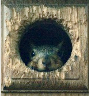
Squirrel squatter!

Screech-Owls on a tree near where I had first noticed "our" owl.