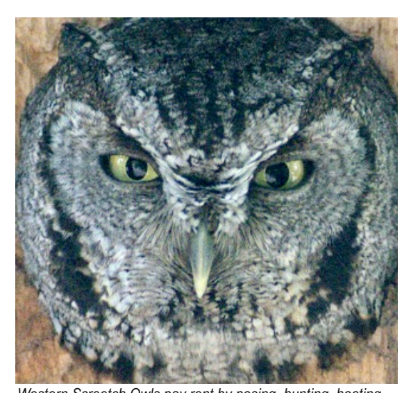
Western Screetch Owls pay rent by posing, hunting, hooting, and glowering. It's a great deal for everybody!

Avians Among Us is a Wrentit column devoted of hyperlocal birding. If you've chronicled some nifty bird activity in your yard, on your block, or at the neighborhood park, please let us know at pas.wrentit@gmail.com