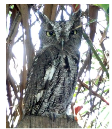
The backyard bird that inspired a birthday bird box

After observing this little guy, I knew what I wanted for my next birthday...an owl box.