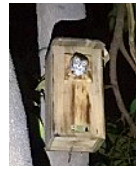
Guess hoo? @Sally Huang

By mid June the owlets had fledged, the Megascops family moved out and our owl box was once again vacant. At twilight we occasionally