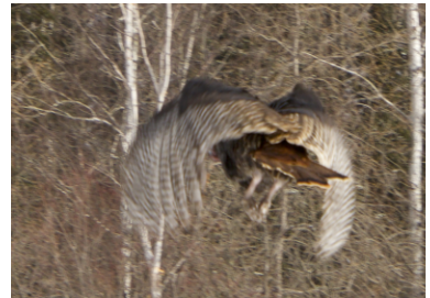
What is this? If you know, keep it under your hat until the meeting!

If it's September that can mean only two things... 1) fall migration's in full swing, and 2) it's time for Pasadena Audubon's annual mystery bird quiz! Join our experts for an evening of photographic mystery bird identification challenges, as well as expert tips and tricks for IDing the mystery species involved.