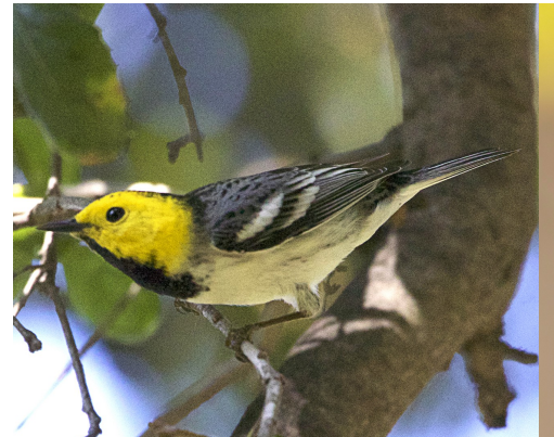
A male Hermit Warbler hops into view momentarily, just long enough for Javier Vazquez to get off a nice shot.

is in the third week of April. Compare that to the Yellowrumped Warbler, which has a peak frequency of over 73% of checklists, and a high count of 110,148. On the other hand. Hermit Warblers aren't nearly as rare as Black-andwhite Warblers, which max out at 1.2% of checklists, with a