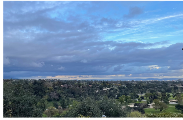
From the backyard of The Perch, the view of Brookside Golf Course (and well beyond) is par excellence